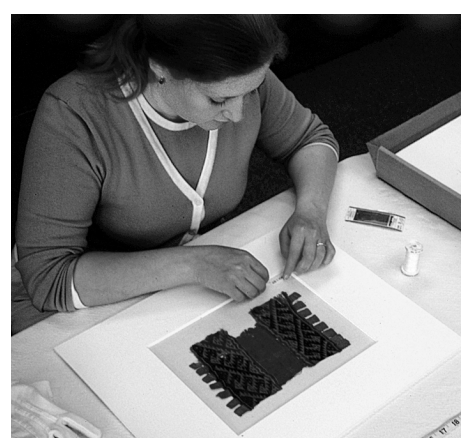
A conservation specialist at HLATC

The Helen Louise Allen Textile Collection at the University of Wisconsin-Madison is one of the largest university textile collections in the United States. The collection, which includes over 11,000 textiles and costumes, is a rich resource for faculty, students and visitors researching art history, anthropology, fashion and textile design. One of the most valuable groups of textiles in the HLATC is the Pre-Columbian Peruvian collection with fabric fragments dating back to 400 B.C. A recent survey of storage conditions revealed the need to replace inferior mounts and provide new mounts for recently accessioned pieces.